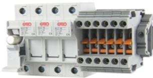
RS485 Modbus communication port